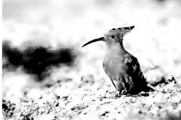
Common Hoopoe Upupa epops

Indian Rollers are seen in Hingolgadh in good numbers, particularly towards the end of monsoon, when the crops are ready in the fields; during this time they visit the fields to eat locusts.